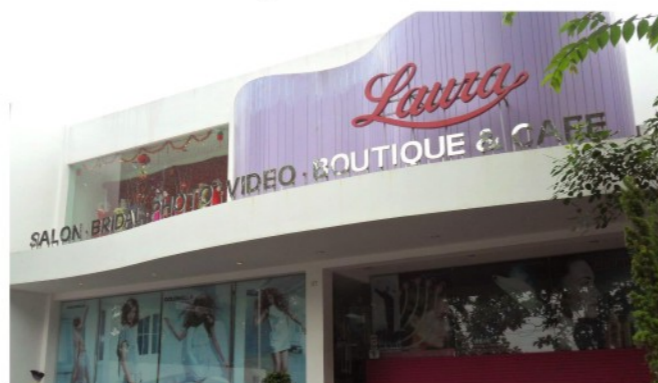
Laura Bridal & Salon - Cirebon, Pile & HCS