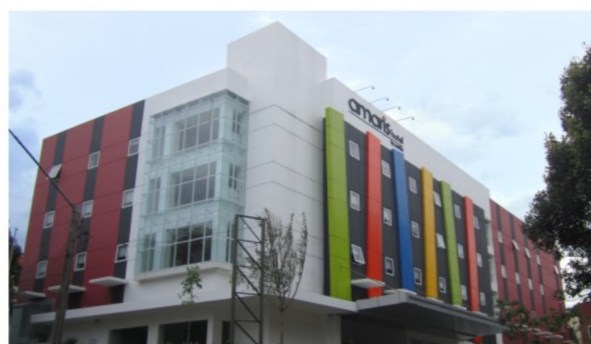
Amaris Hotel - Bandung, Hydraulic Jacking Pile