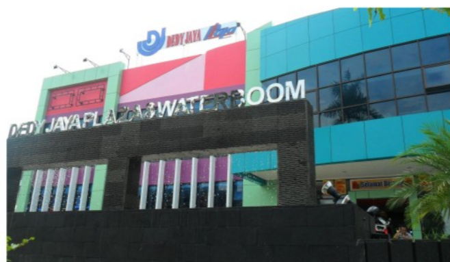
Dedy Plaza - Slawi, HCS