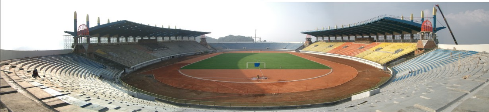
Stadion Si Jalak Harupat - Bandung, Bangku Precast