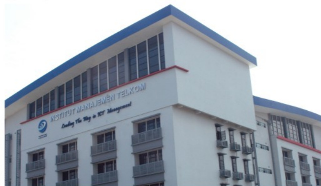
Institut Manajemen Telkom - Bandung, Pagar, Pile & U-Ditch