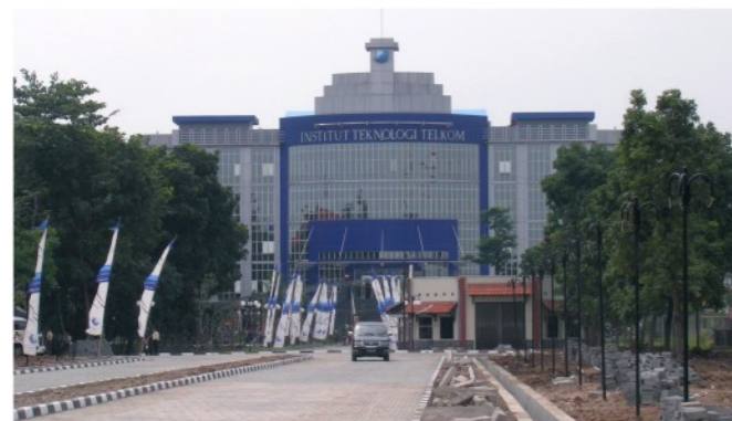
Institut Teknologi Telkom - Bandung, Pile & Half Slab