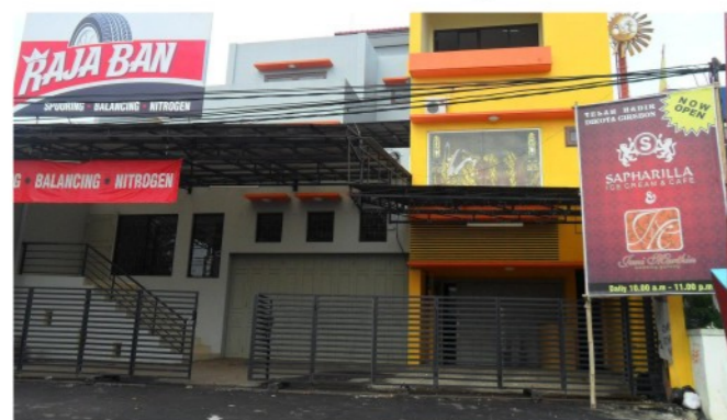
Showroom 'Raja Ban' - Cirebon, Pile